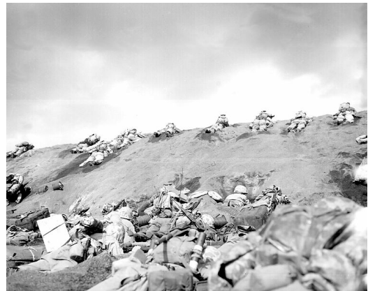
Iwo Jima - 1945 Before and After 2010